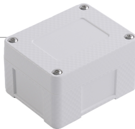
103 series economy

Smart choice — the economical edition of BWP102.