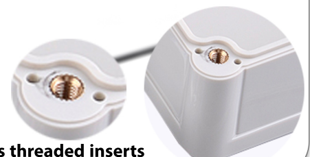
brass threaded inserts